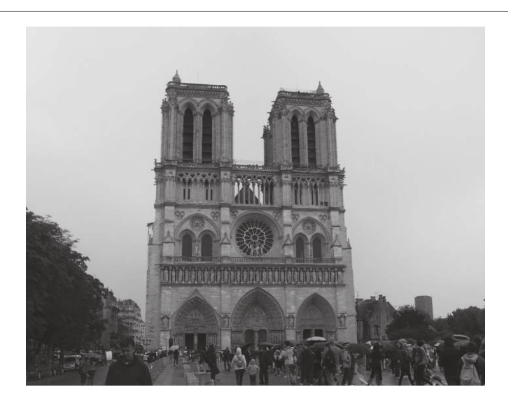
Notre Dame Cathedral, Paris