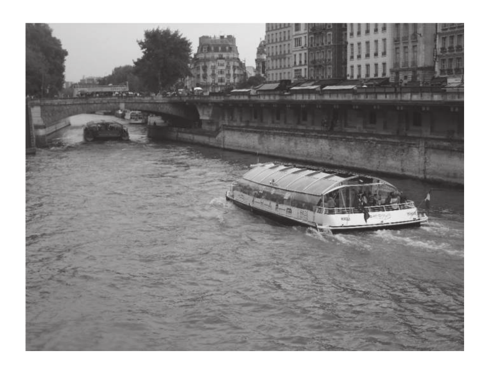
Boat Trips on the River Seine, Paris